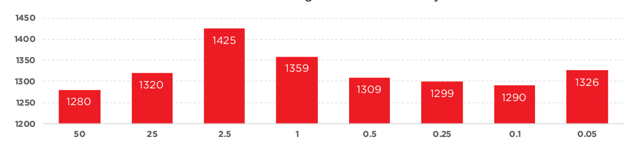
Figure 1: Nanoliter Volume Tagmentation Efficiency: Fragment sizes, analyzed using the Agilent Bioanalyzer 2100 high sensitivity kit, remain consistent from standard reaction volumes (50 \mu L) down to 50 nL using an Echo 525 Liquid Handler (n = 10, target insert size = 1250bp).

Next, in an effort to further reduce the cost of NGS sample preparation, we sought to replace column/ matrix-based purification steps in the standard workflow. We found that surfactant-mediated denaturation of Tn5 was sufficient to liberate enzyme-bound DNA for subsequent PCR-mediated barcoding and adapter tagging. This step bypasses column purification, as outlined in standard NGS library preparation protocols. In doing so, it saves consumables cost per sample and also allows for scalability beyond 96/384-well microtiter plates. After surfactant-mediated dissociation, the reactions were diluted 50-fold, which allows for efficient downstream PCR. This process could be scaled easily due to the low initial tagmentation volume (500 nL) followed by immediate dilution into standard PCR barcoding reactions (25 \mu L). After PCR barcoding and quantification using standard fluorometric strategies, the samples were normalized by transferring a range of volumes with the Echo Liquid Handler and pooled for sequencing.